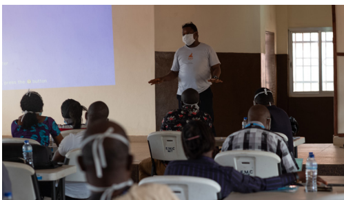
Freetown, Sierra Leone

We're also working to increase our advocacy efforts in the U.S. to maintain and generate further commitments of long-term investments in health care as a human right.