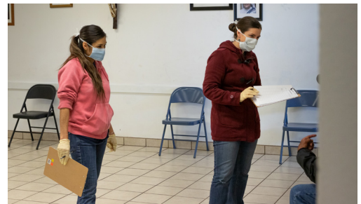
Gallup, New Mexico Navajo Nation

We're equipping all CHWs with the knowledge and training needed to protect themselves from the virus, educate the households they care for, and safely accompany patients who may need to practice social distancing or seek care.