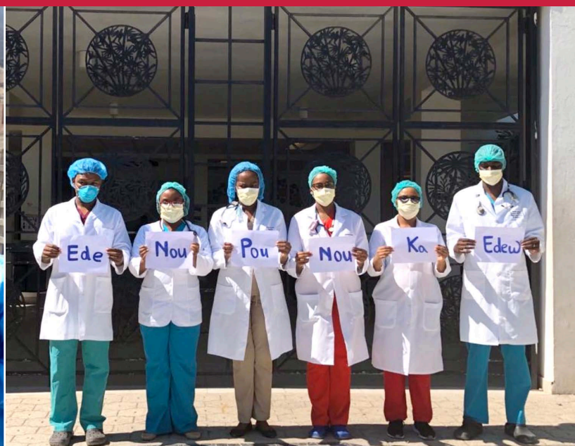
Nurses and doctors responding to the COVID-19 pandemic stand outside University Hospital in Mirebalais, Haiti, and hold signs in Haitian Creole that read, "Help us so that we can help you."