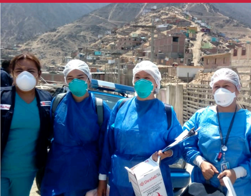
Staff working with PIH in Peru conduct rapid tests and contact tracing throughout communities north of Lima.

PIH's deep experience in the prevention, containment, and care of infectious diseases has shown that the provision of care as a human right is the most important aspect of infection control. PIH's response to COVID-19 prioritizes dignified care for the most vulnerable alongside efforts to contain spread of the virus. Through the support of our partners, PIH is saving lives and demonstrating what aggressive, preventive action in vulnerable settings can achieve.